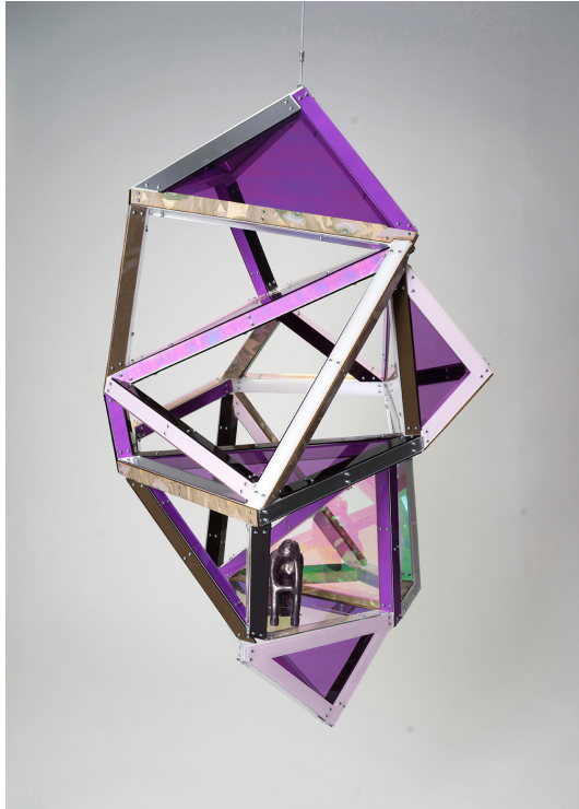
Venus , 2019, wood, collage on wood, acrylic, ceramic, and paint, 47 x 24 x 22".

commune in Trinidad, Colorado. "Droppers," as its collaborators were called, used salvaged materials like car hoods found at trash yards to make geodesic domes in the style of Buckminster Fuller. The exhibition's title work, Pigeon Quilt , with its small triangular interconnected planes, uses Fuller's preparatory drawing for the interior of a geodesic dome as a jumping-off point. In the words of the artist, experimental communities and everything that came with them, "epitomize our best instincts and our more questionable ones, colliding."