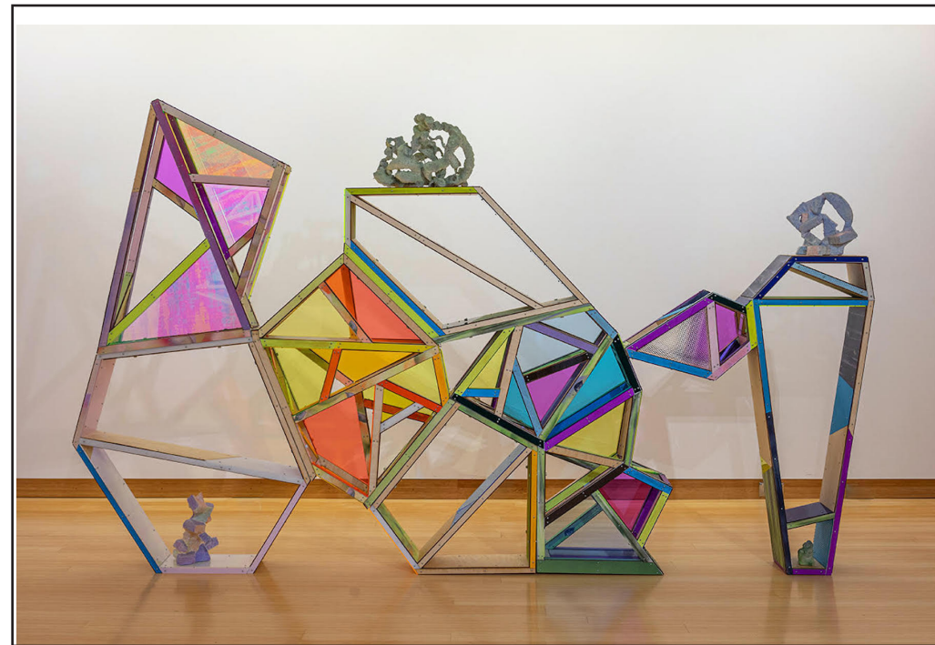
Plinth , 2019, wood, acrylic, collage and paint on wood, foam, plaster, wire, and paint, 67 x 114 x 7 1/2"