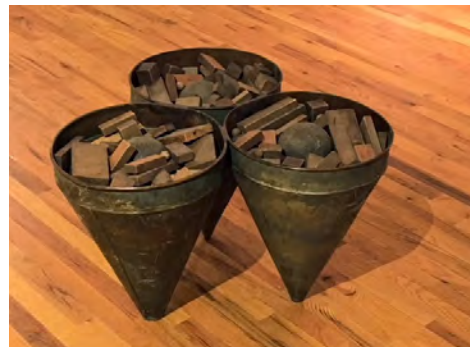
Lenny Kislin, Blockballed , 2017, mixed media. Estate of the Artist.