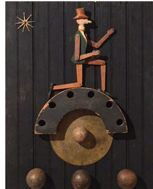
Lenny Kislin, Proposing to Dorothy , 2017, mixed media. Estate of the Artist.