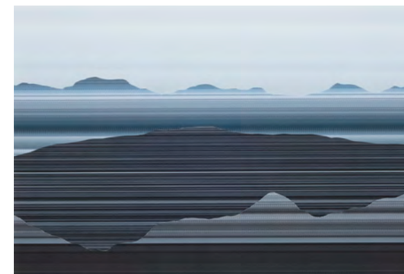
Paper Landscape 1 , 2017, Cut Paper