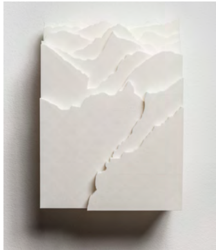
From top to bottom: Paper Landscape 2 , 2017, Cut Paper and PLA Print Paper Landscape 3 , 2017, Cut Paper and PLA Print Icefall , 2017, PLA Print